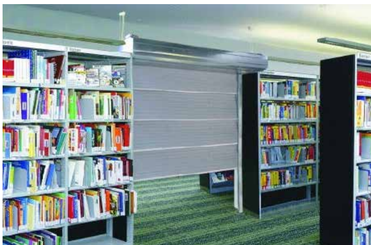
Fibershield –/60/60 can be used as an operable wall to protect combustible assets.

10A power supply and an alarm signal in the form of a normally closed dry contact. A localised smoke or heat detector may also be used to activate the system. Please contact our technical department for details on 1300 665 471.