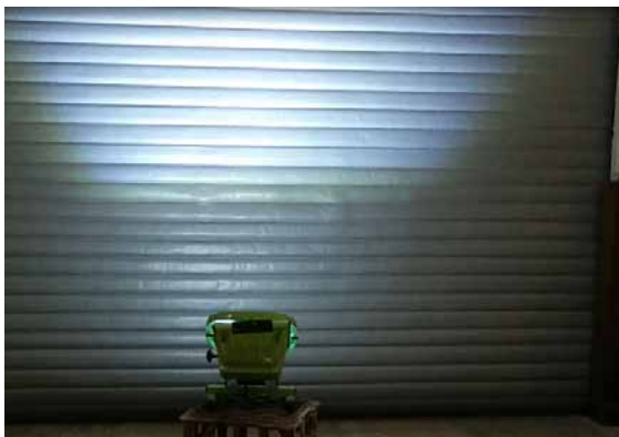
Fibershield -/60/60 unique barrier provides full insulation equivalent to a fire resistant wall when fully deployed

The Fibershield -/60/60 provides full fire integrity and insulation for 60 minutes without the need for sprinklers.